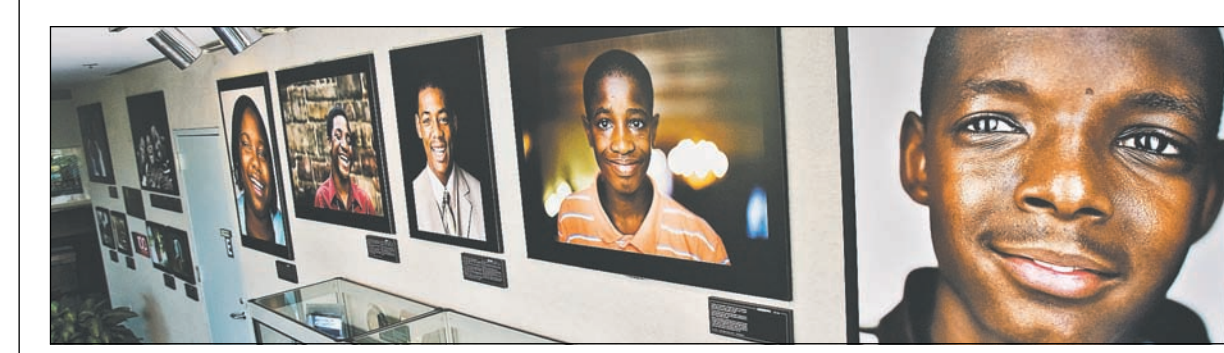
A display at New Jersey Natural Gas in Wall features photos provided by the Heart Gallery of New Jersey of children awaiting adoption. The program was started in 2005.

APP.com ON THE WEB: Visit our Web site, www.app.com, and click on this story for a link to: Heart Gallery of New Jersey.