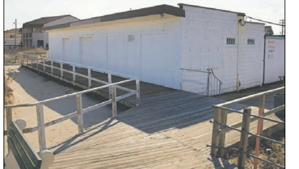
The bathhouse and snack bar at Risden's Beach in Point Pleasant Beach would be demolished if a five-lot subdivision is approved.