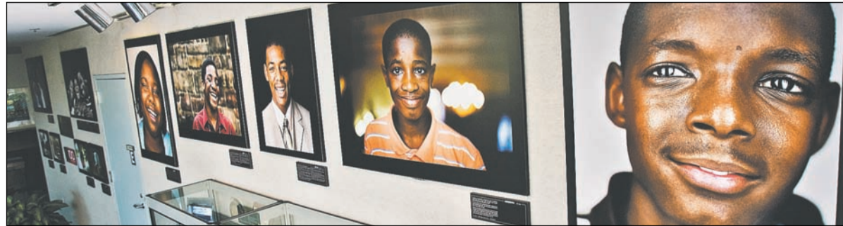
A display at New Jersey Natural Gas in Wall features photos provided by the Heart Gallery of New Jersey of children awaiting adoption. The program was started in 2005.

APP.com ON THE WEB: Visit our Web site, www.app.com , and click on this story for a link to: Heart Gallery of New Jersey.