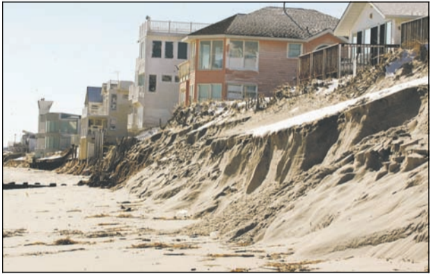
Erosion following a coastal storm threatens homes in the Brant Beach section of Long Beach Township, in this view from two years ago.