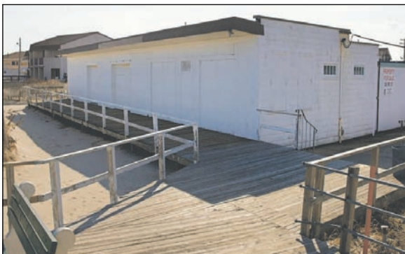
The bathhouse and snack bar at Risden's Beach in Point Pleasant Beach would be demolished if a five-lot subdivision is approved.